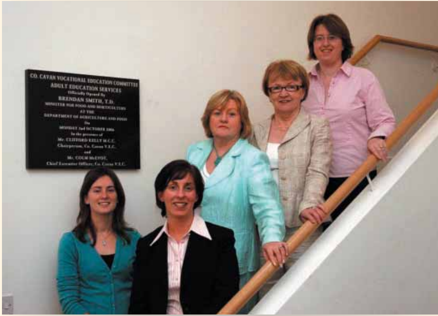
County Cavan Vocational Education Committee - Adult Education staff