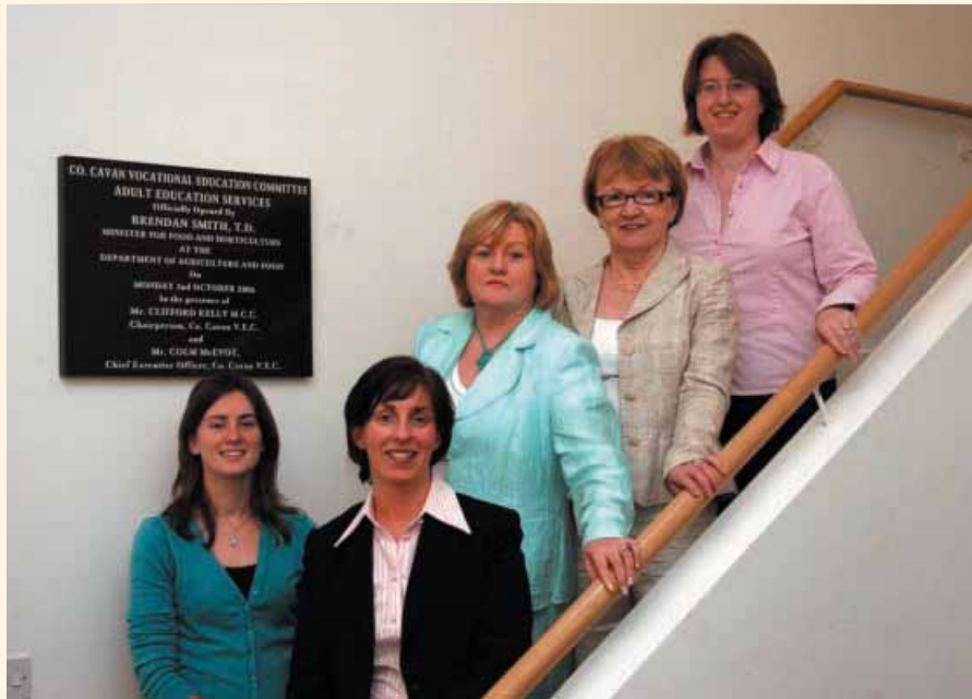
County Cavan Vocational Education Committee - Adult Education staff