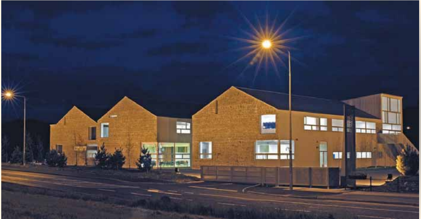
Cavan Institute new building officially opened March 2007

Floristry, Security Studies, Beauty Therapy, Sports Therapy, Cultural Studies, Nursing Studies, Drama, Music, Classroom Assistant, Child Care and Social Studies.