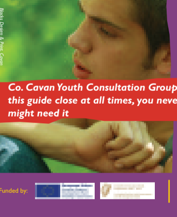
Blocks Design & Print, Cavan

Teach Oscail FRC, Tullacmongan, Cavan ☎ 049 4372730